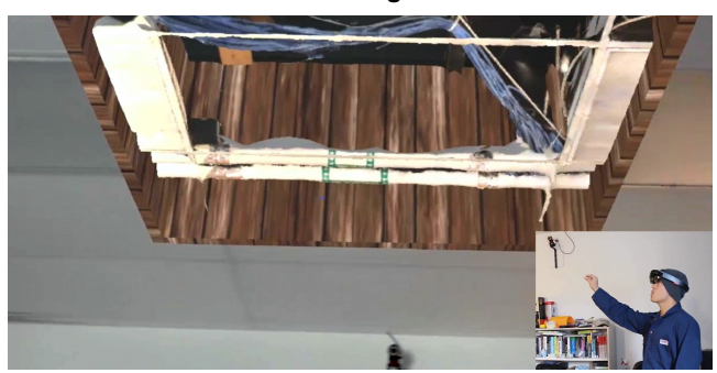
Displaying virtual excavations to facilitate building maintenance.