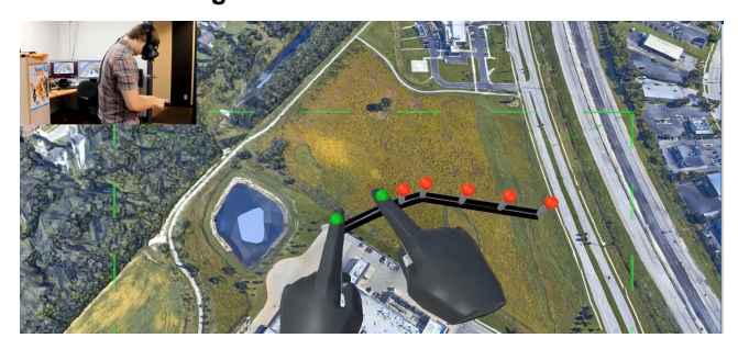
Road design in a photorealistic virtual environment.