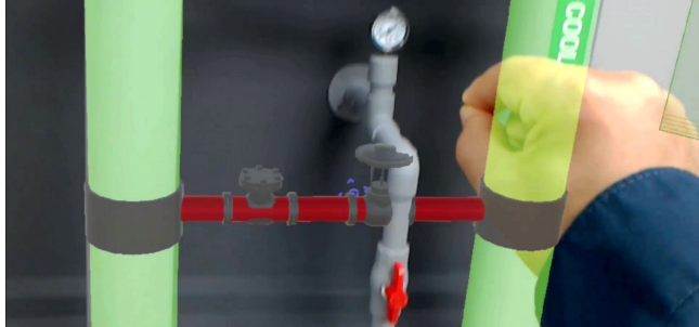
Using the Microsoft HoloLens for plant maintenance and pipe design.

More proofs of concepts can be seen on: https://www.youtube.com/user/BEAppliedResearch/videog .