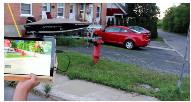
Using situated simulation based on photorealistic meshes to provide accurate and robust augmentations of city environments.